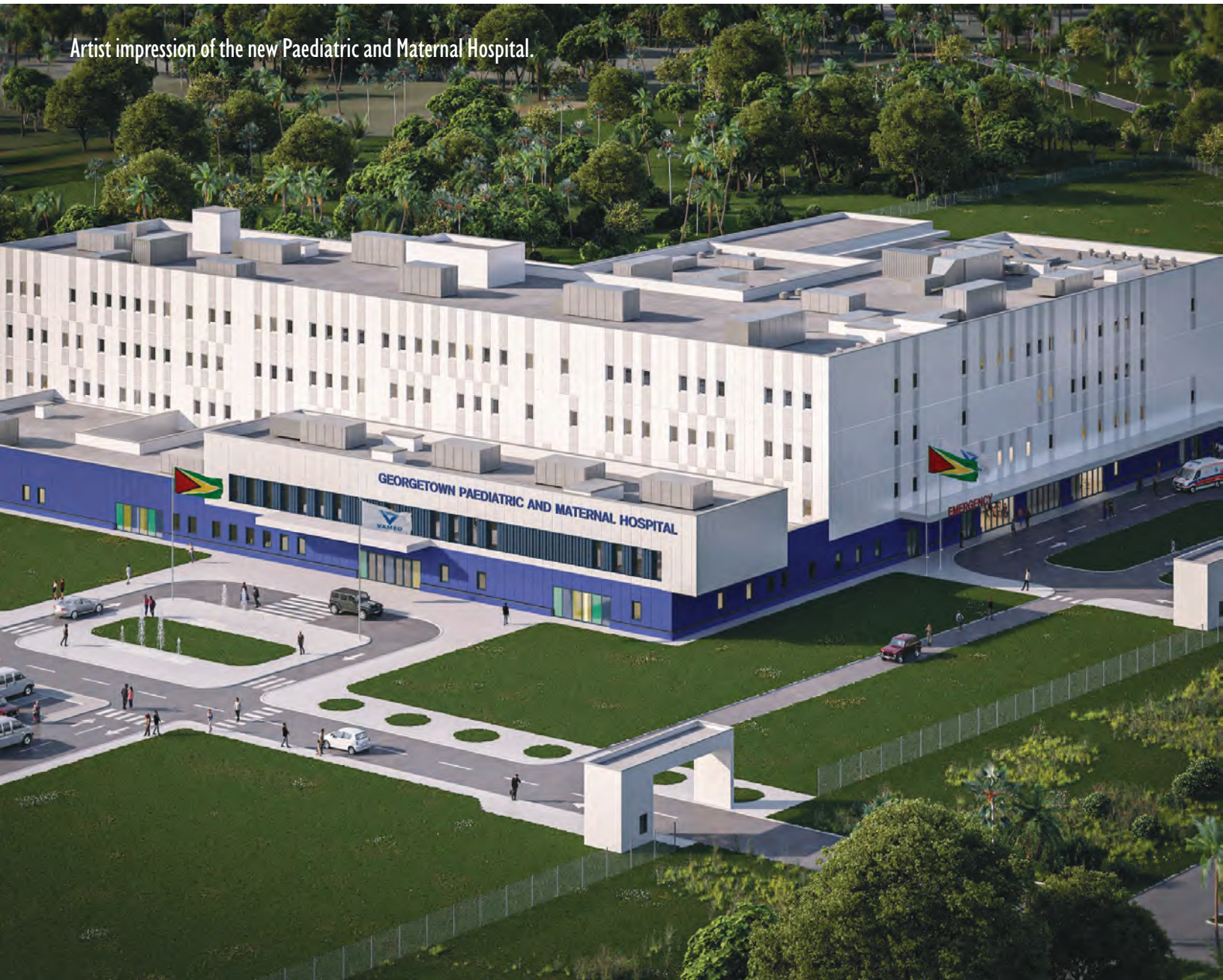
Artist impression of the new Paediatric and Maternal Hospital.