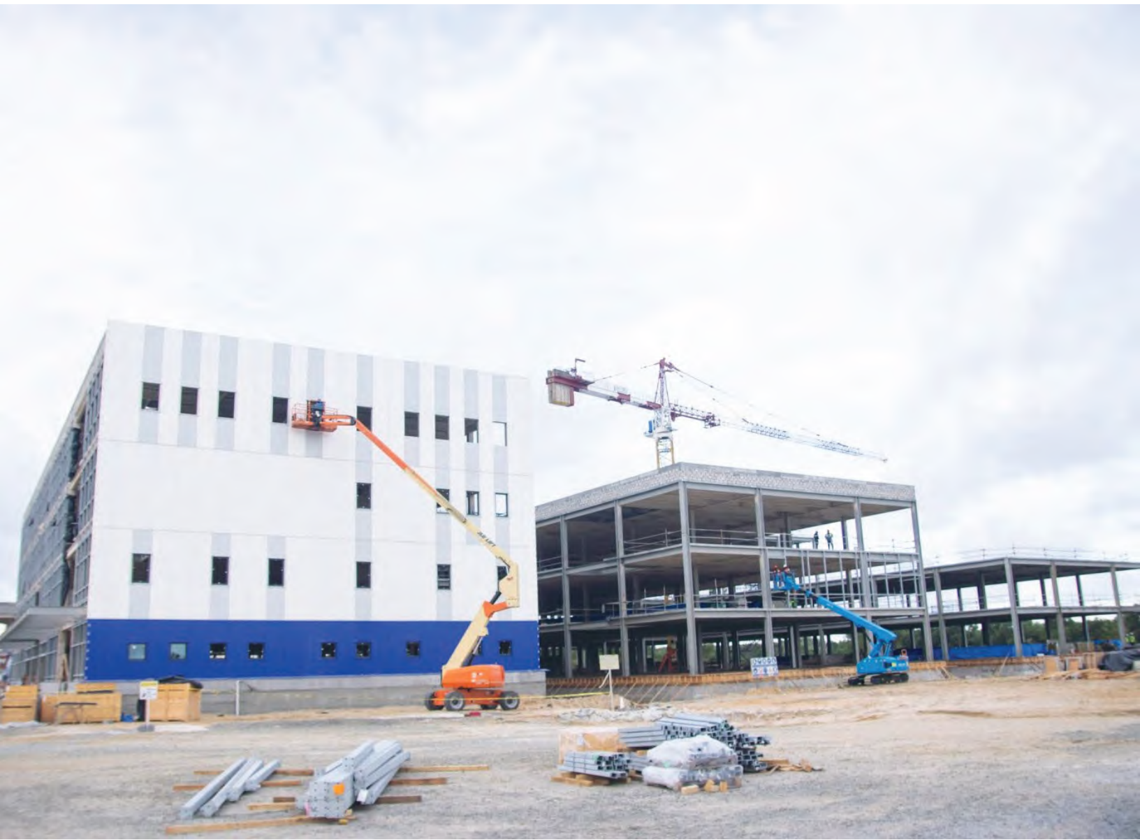
BELOW: The hospital takes shape.