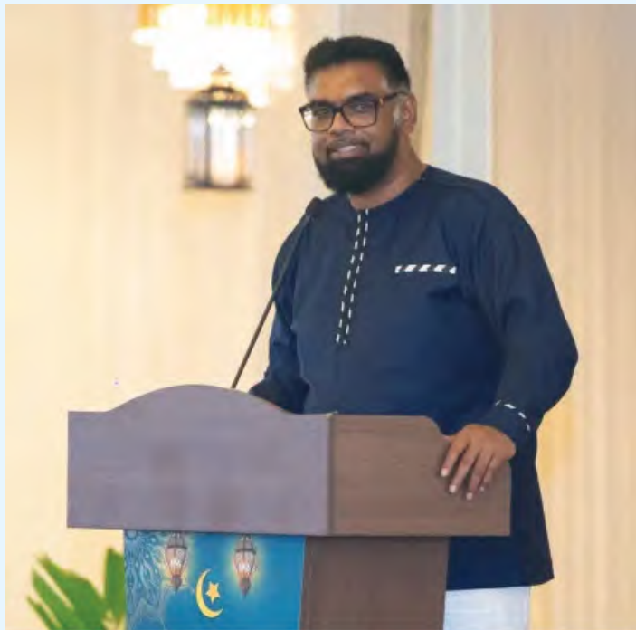
His Excellency the President and participants at the National Ramadan Village

The President was candid about the growing health challenges facing the nation, particularly the rise in diabetes and the increasing number of persons requiring dialysis. While acknowledging that Government support has made treatment more accessible, he stressed that prevention must be the priority.