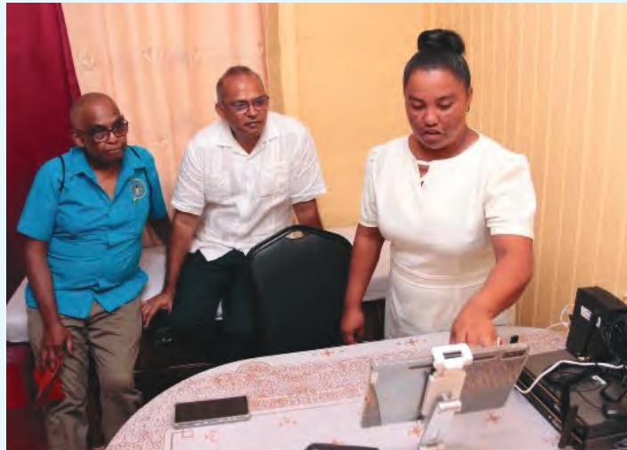
One of the Community Health Workers at the Imbotero Health Post in Region One (Barima-Waini) shows Minister of Health, Honourable Dr Frank Anthony, the telemedicine procedure.

The Minister also emphasised that the Government’s investment in telemedicine aligns with ongoing upgrades to health centres, district hospitals, and new regional hospitals to ensure that communities across Guyana can receive healthcare services.