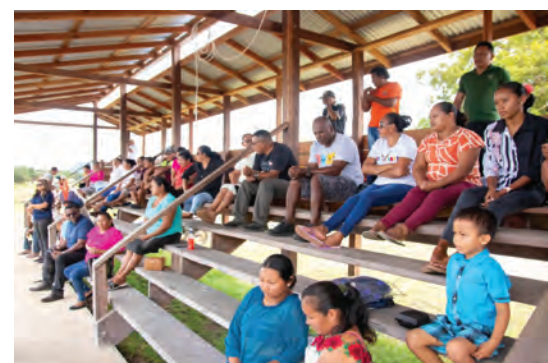
Residents of Annai, Surama, Wowetta and Rupertee.

During this outreach session, the Minister highlighted the ongoing growth and development efforts in the hinterland and reaffirmed government's commitment to improving healthcare across the country.