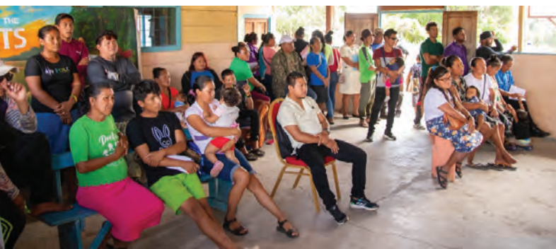
Residents of Rewa, Crash Water and Apoteri during the meeting.

The Minister also praised residents for their active role in selecting trusted individuals for health training, emphasising the importance of community-led development.