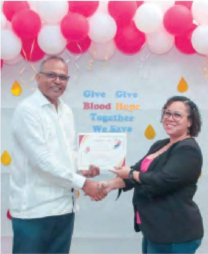
Minister Anthony hands over a certificate of appreciation to one of the country's top voluntary blood donors.

Minister of Health, Honourable Dr Frank Anthony, in observance of World Blood Donor Day on June 14, joined the National Blood Transfusion Service (NBTS) in celebrating the life-saving contributions of voluntary blood donors and outlining transformative advancements in Guyana's blood transfusion infrastructure.