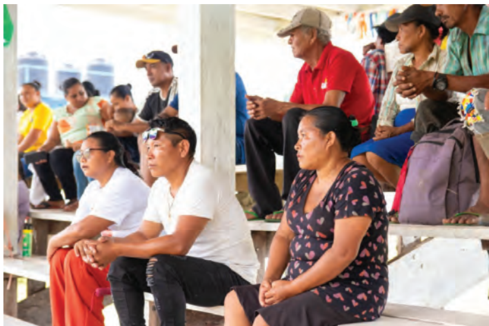
Residents of Kwatamang, Aranaputa and Yakarinta.

The ministerial outreach continued on June 12 with residents of Kwatamang, Aranaputa and Yakarinta. During the meeting, the Minister reflected on the government's ongoing dedication to direct community engagement and the promotion of local development.